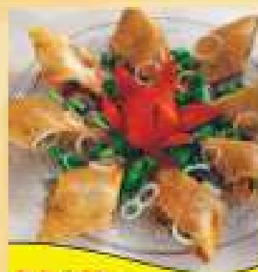
Spring Roll Dosa