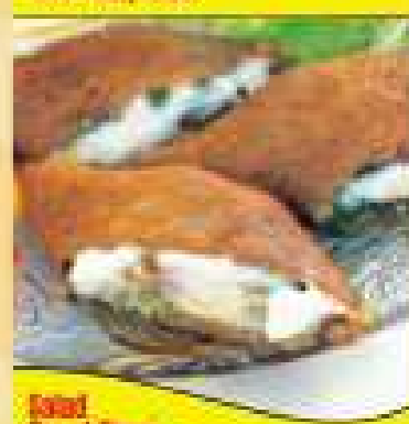
Salad Roast Dosa