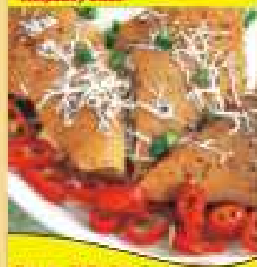
Paneer Chilly Dosa