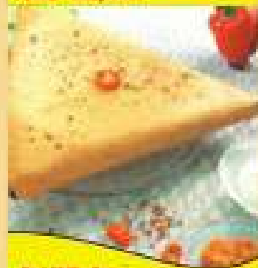
Red Chilly Dosa